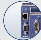
Flexy 203 (MPI - Profibus)